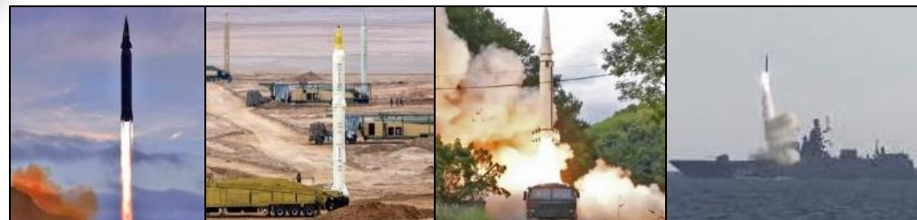
North Korea IRBM Hwasong-8