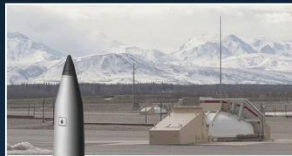
Ground-based Midcourse Defense (GMD)